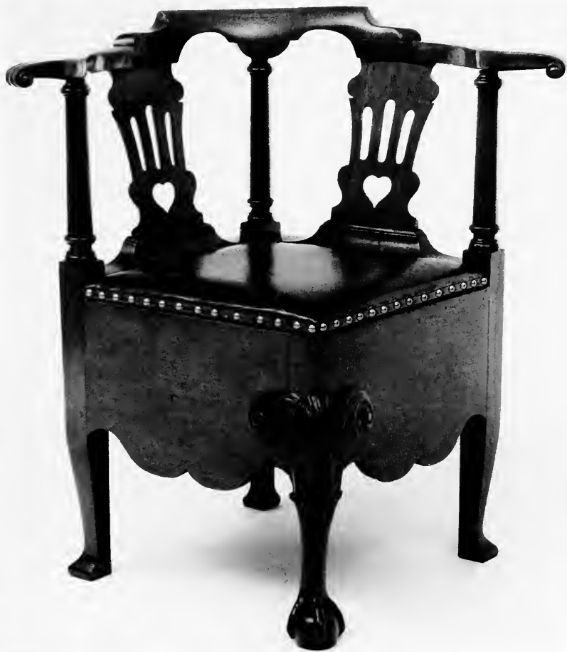
Corner chair by Peter Scott; walnut; Williamsburg, Va.; c. 1760–1775. HOA 31 \frac{7}{8} " ; WOA 18 \frac{1}{2} ". MES-DA acc. 2921.